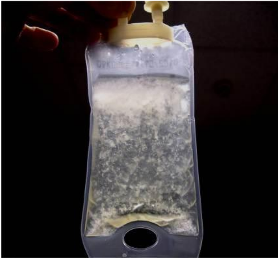
Precipitation – an example of physical incompatibility