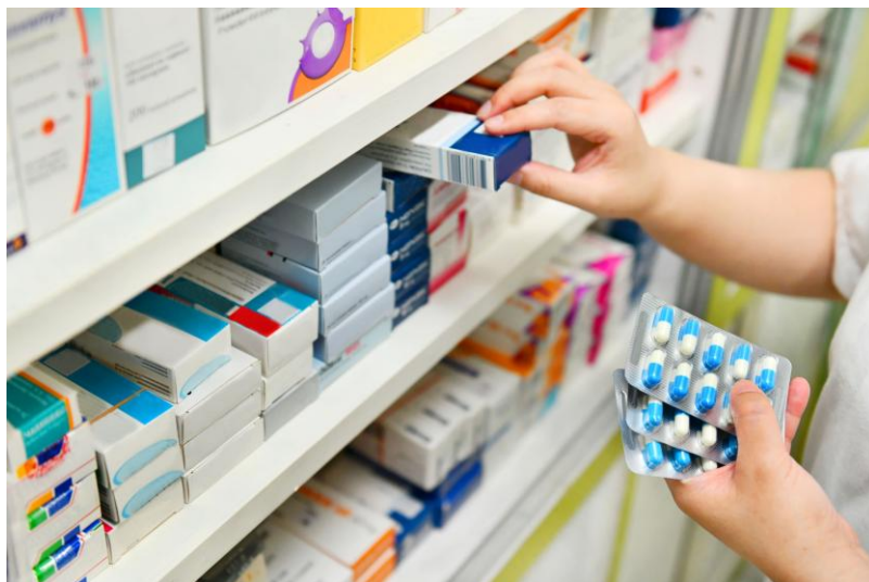
Can you use a different drug?