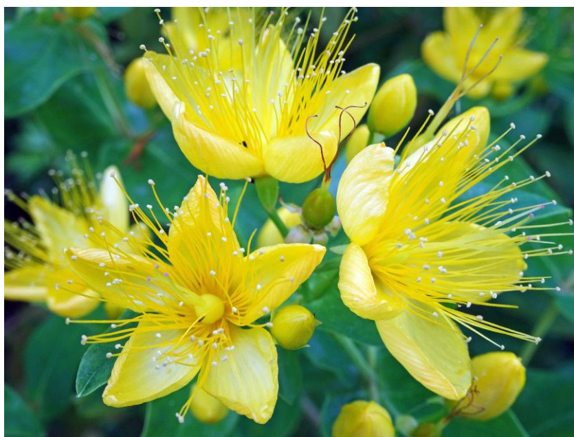
St John's wort

Complementary and alternative medicine (CAM) is a broad term that includes many beliefs and therapies, but in this tutorial we shall look at herbal and homeopathic medicines, and dietary supplements.